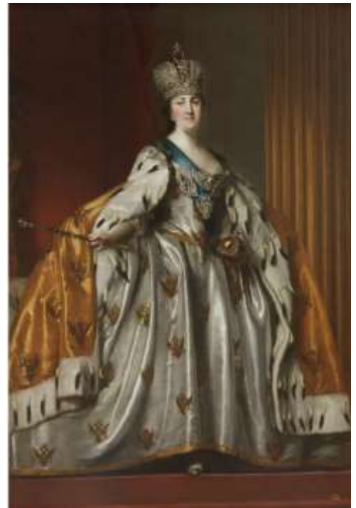
Above: Catherine La Grande , by Vigilius Eriksen

Born of humble origins, Robert Southey went on to become Poet Laureate of England from 1813 until his death in 1843. A contemporary of 19 th century Romantic poets like William Wordsworth and Samuel Taylor Coleridge, he was an incredibly prolific writer of both poetry and prose. One of the original versions of the